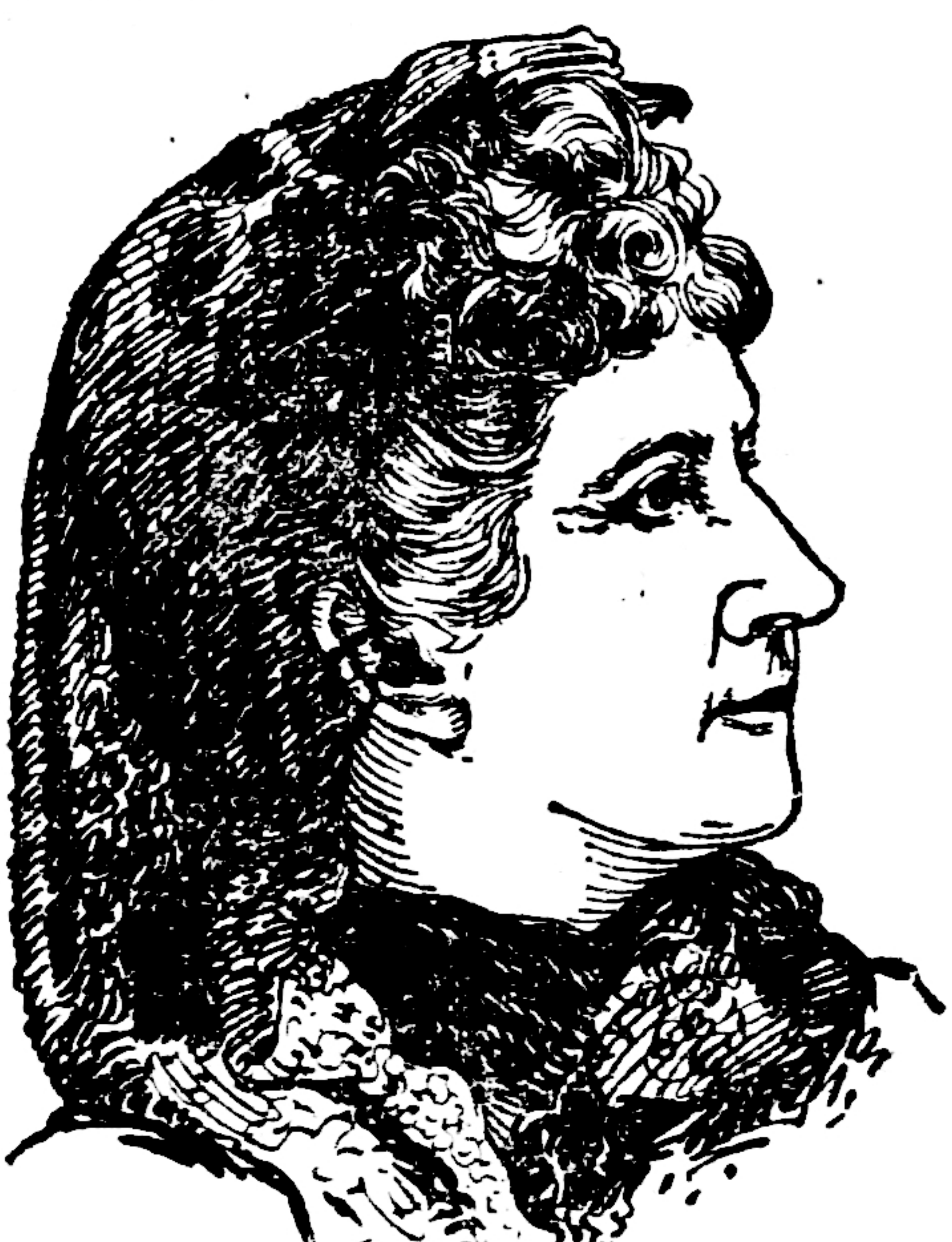
Mrs. Belva A. Lockwood.

Mrs. Belva Lockwood, the eminent barrister, of Washington, D. C., is the only woman who has ever been a candidate for the Presidency of the United States. She is the best known woman